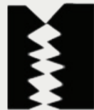
Rough boundaries = poor contact

SURFACE QUALITY - Make sure your surfaces are smooth - spec a surface roughness of 0.8um Ra. You want the mating surfaces to contact completely. The images below show how surface roughness (exaggerated) affects effect contact area and how thermal grease (shown here in blue) can improve it: